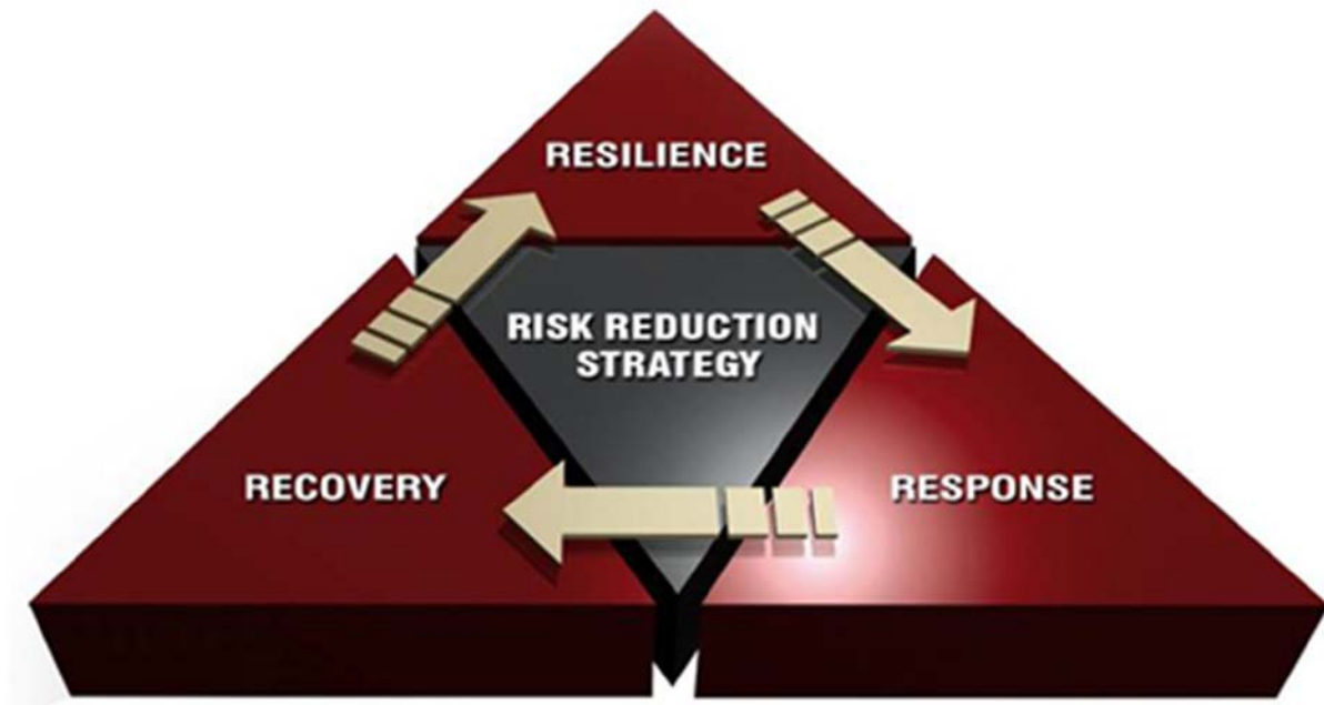
Fig – 2