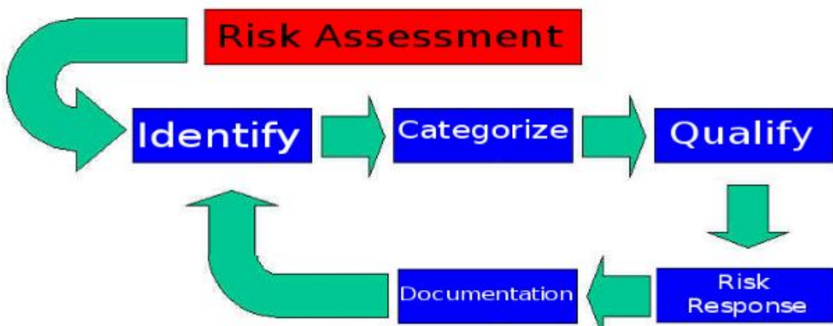
Fig - 1